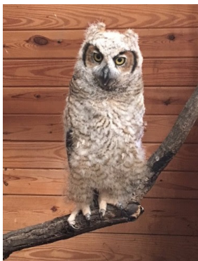
Nestling great horned owl