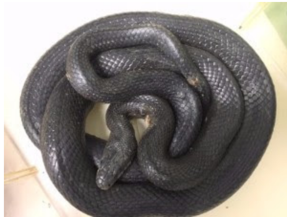
Rat snake with snake fungal disease

Research is continuing into raccoon polyarthrititis, and in April, I diagnosed a case caused by a new mycoplasma species. This mycoplasma species has also been found in a human patient. We're looking for new cases to help us understand more about how raccoons are picking up this infection.