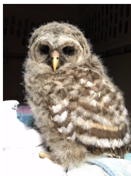
Injured barred owl

Animals currently receiving care include screech, barred and great horned owls, red-tailed hawks and a kestrel, big brown bats, red foxes and mink, box, painted and wood turtles, a robin, bluejay, mourning dove and cardinal.