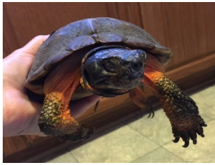
Wood turtle with eye infection