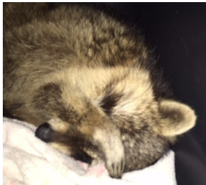
Raccoon with polyarthrititis

Research is continuing into raccoon polyarthrititis, and in April, I diagnosed a case caused by a new mycoplasma species. This mycoplasma species has also been found in a human patient. We're looking for new cases to help us understand more about how raccoons are picking up this infection.